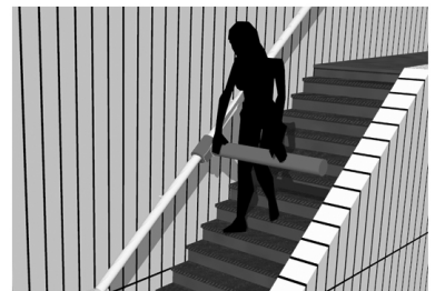
Figure 1. Descending stairs safely with a removable rail in front of user 3

W.J.M.J. VAN DEN BOUWHUIJSEN, R. DIJKMAN. AEM-cube design. Gerontechnology 2012;11(2):111-112; doi:10.4017/gt.2012.11.02.567.00 Purpose Basic principles of design are aesthetics, functionality, and regulations. Our physical and instinctive characters hardly change 1 . People, especially the elderly, will feel better if a design is based on their culture and behaviour, because they have more difficulties to accommodate new situations. Method 'The AEM-Cube' 2-3 is one of the models to compose effective teams based on the diversity of team members during the growing phase of an organization. The model is based on the need of an organization (S