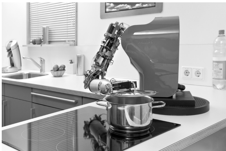
Figure 1: The people-friendly robot arm of RoboEarth

Results & Discussion Philips Applied Technologies develops human centered