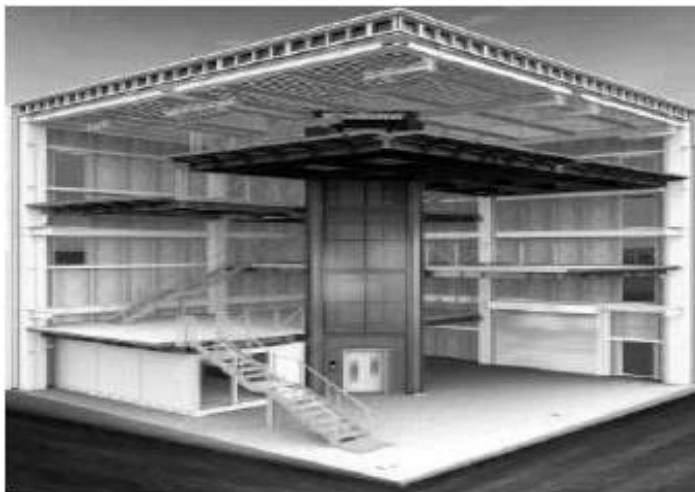
Figure 1. the WABOT home in Japan 4

F.J.M. VAN GASSEL. Robotizing housing and design. Gerontechnology 2010;9(2):74-75 ; doi:10.4017/gt.2010.09.02.128.00 Purpose In the next 20 years the Dutch workforce will decrease from 11 to 10 million persons 1 . In the domain of housing construction it calls for two roads of innovation: (i) robotizing of job elements, and (ii) providing the built environment with robot characteristics. Both approaches call for a new view on design and construction. Some best practices already exist: (i) Smoothing concrete floors with a trowel machine, controlled by a construction worker, and (ii) Stairs equipped with small elevators and ceiling cranes in bath rooms, controlled by the end-user. In the future an increase of special equipment or even robotics will take place in dwellings. William Mitchel, former dean of MIT's School of Architecture and Planning, approaches dwellings as 'robots to live in' 2 . An example of such a dwelling-robot is the WABOT home 3 (Figure 1). Floors move up and down to increase the mobility of the inhabitants. Although technological support can be made available by current processes of mechanization, robotizing and automation 4 , certain physical, cognitive and organizational characteristics are needed in the process of construction and renovation that are little taken into account. Technologi-